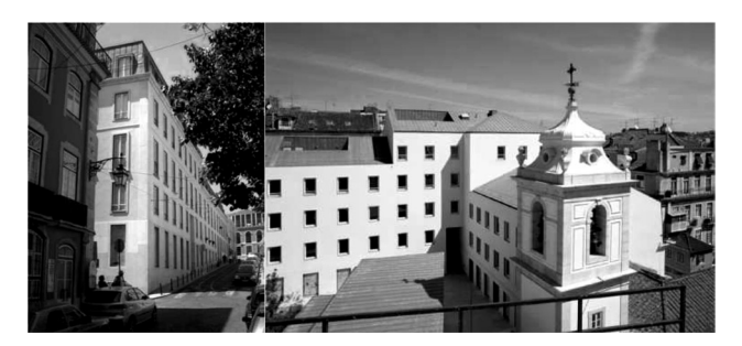
Fig. 2. Public square, viewpoint and public garage Portas do Sol in Alfama neighbourhood, design by Manuel and Francisco Aires Mateus 2005.

architectural structures, and the intangible one, referring to the sphere of impressions, memory and identity.