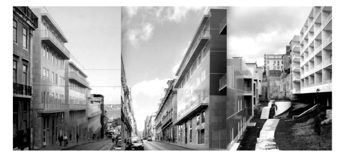
Fig. 4. Multifunctional complex Terraços de Bragança design by Álvaro Siza Vieira 2004. Photos by F. Marquez Cecilia and R. Levene 2008