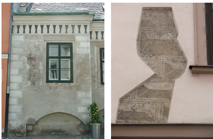
Ill. 9. Traces of historical polychrome on dwelling in Heiligenstadt, Vienna and remains of Renaissance sgraffito in the Old Town in Prague.