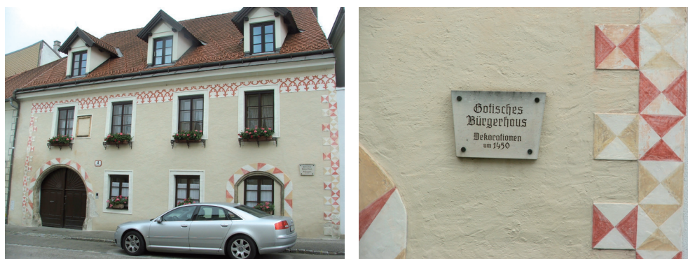
III. 2. The dwelling of medieval origin in the Market Square in Eggenburg, Lower Austria.