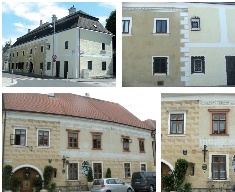
Ill. 6. The dwellings in south Vienna (above) and in Rust am See, Lower Austria (below). By introducing two different colour schemes to a flat surface at the same time, the building is divided into smaller parts.