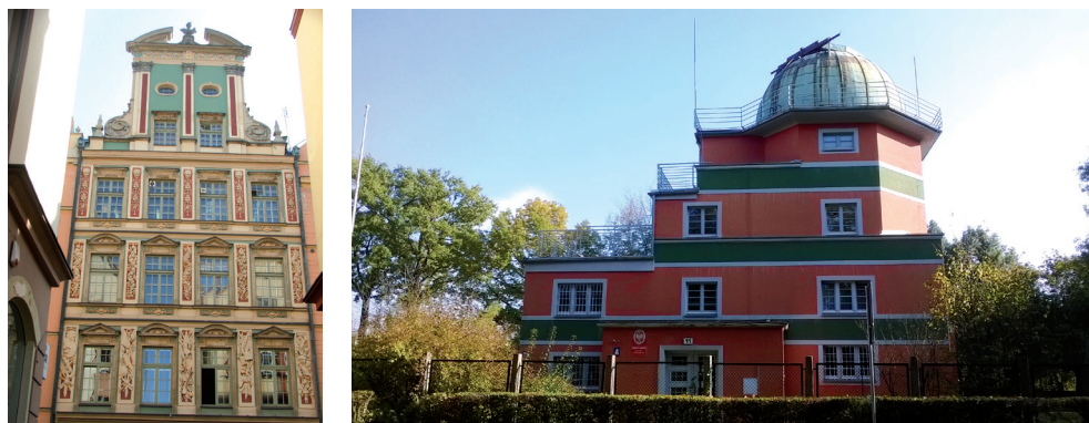
III. 3. Examples of colour schemes based partially on historic data and partially on other factors such as personal preferences of key individuals – the Baroque dwelling at 12 ulica Kuźnicza, Wroclaw (left) and the modernist observatory at 11 ulica Kopernika, Wroclaw (right).

A combination such as that described above is currently visible on a dwelling at 12 ulica Kuźnicza, and on the observatory at 11 ulica Kopernika, both in Wroclaw. According to the results of paint research, a monochromatic colour scheme was applied to the exterior at 12 ulica Kuźnicza in the first and second chronological phases, these were green and red, respectively 8 . The wall surfaces and the stucco works were originally painted light green, close to 9385/9369 in the KEIM colour chart. It was not possible to establish the original colour of stone components due to the poor condition of paint remains [2]. As previously mentioned, red was established as a colour of the second chronological phase. A two-coloured scheme of green and red that combined results from both phases was designed during the refurbishment and finally applied to the façade. In this way, a new composition was created which was unproven by paint research (III. 3).