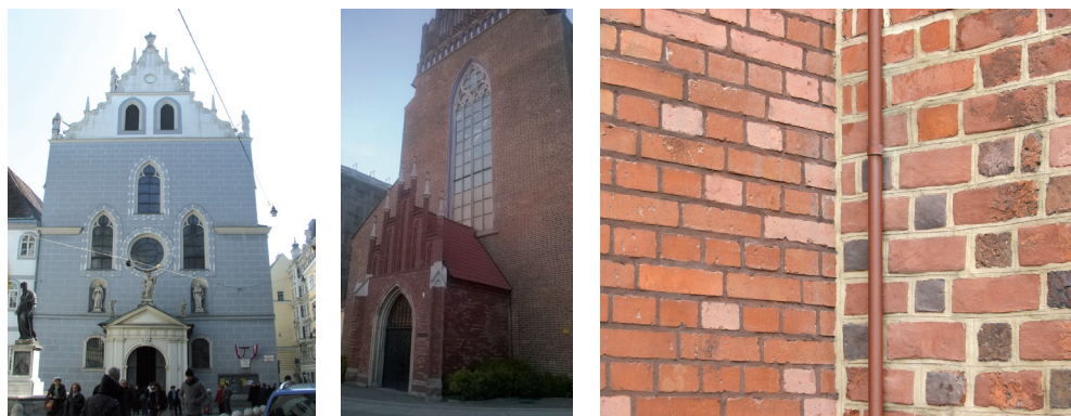
Ill. 5. Examples of presentation of colour schemes form different periods – the Franciscan church, Old Town, Vienna (left); Corpus Christi Church, 26 ulica Świdnicka, Wrocław (middle and right).