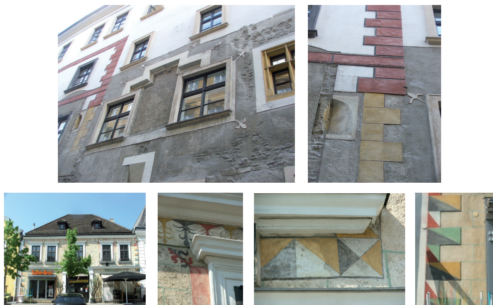
Ill. 7. The details of elevations of dwellings in central Vienna (the upper row) and Perchtoldsdorf, Lower Austria (the lower row) – the colour compositions are an effect of juxtaposing various remains of polychrome from different phases and styles.

Colour schemes that are composed of various elements from different chronological phases – pieces that were applied in different centuries and were attributed to different styles – may in fact create a new composition that is more or less clear to passers-by. This way, all the valuable remains are saved, preserved and exposed, but the completely new composition may in fact be slightly chaotic. Such a solution was spotted on the back wall of a dwelling in the Old Town in Vienna – the entire wall is covered with various elements from the Middle Ages and the Renaissance. Similarly, the façade of a dwelling in Perchtoldsdorf, Lower Austria was decorated with items from different phases: black and red window surrounds; black, yellow and white window surrounds; white window surrounds; a multi-coloured corner rustication, a multi-coloured cornice; a yellow and green wall surface – yellow imitating stone blocks and green imitating mortar joints (Ill. 7).