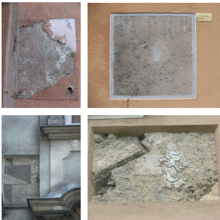
Ill. 8. Samples of original substrates presented as evidence in Wrocław, Berlin, Vienna and Wiener Neustadt.