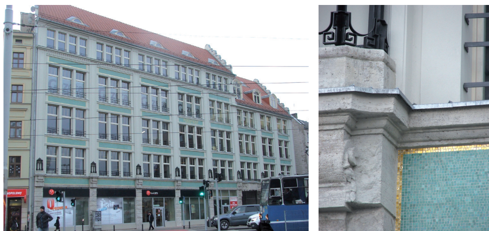
Ill. 1. Wrocław, ulica Świętego Antoniego, ‘Pokoyhof’ – the former department store from 1910 after recent refurbishment to the original colour scheme

As mentioned above, it happens that the examination of original colours achieves partial success; often, either the colour of the wall surfaces or the colour of architectural details is detected. In such cases, colours that were sometimes discovered were combined with colours that were considered by conservators, architects or public officials as the most suitable.