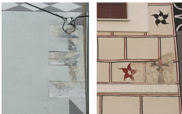
Ill. 10. Original remains incorporated into restored colour schemes: dwellings in Wiener Neustadt (left) and in Görlitz (right).

Therefore, a restoration of the original colour scheme may consist of a sample of original coating. In this way, original and restored polychromes are usually differentiated by saturation and/or lightness of the same hue (Ill. 10).