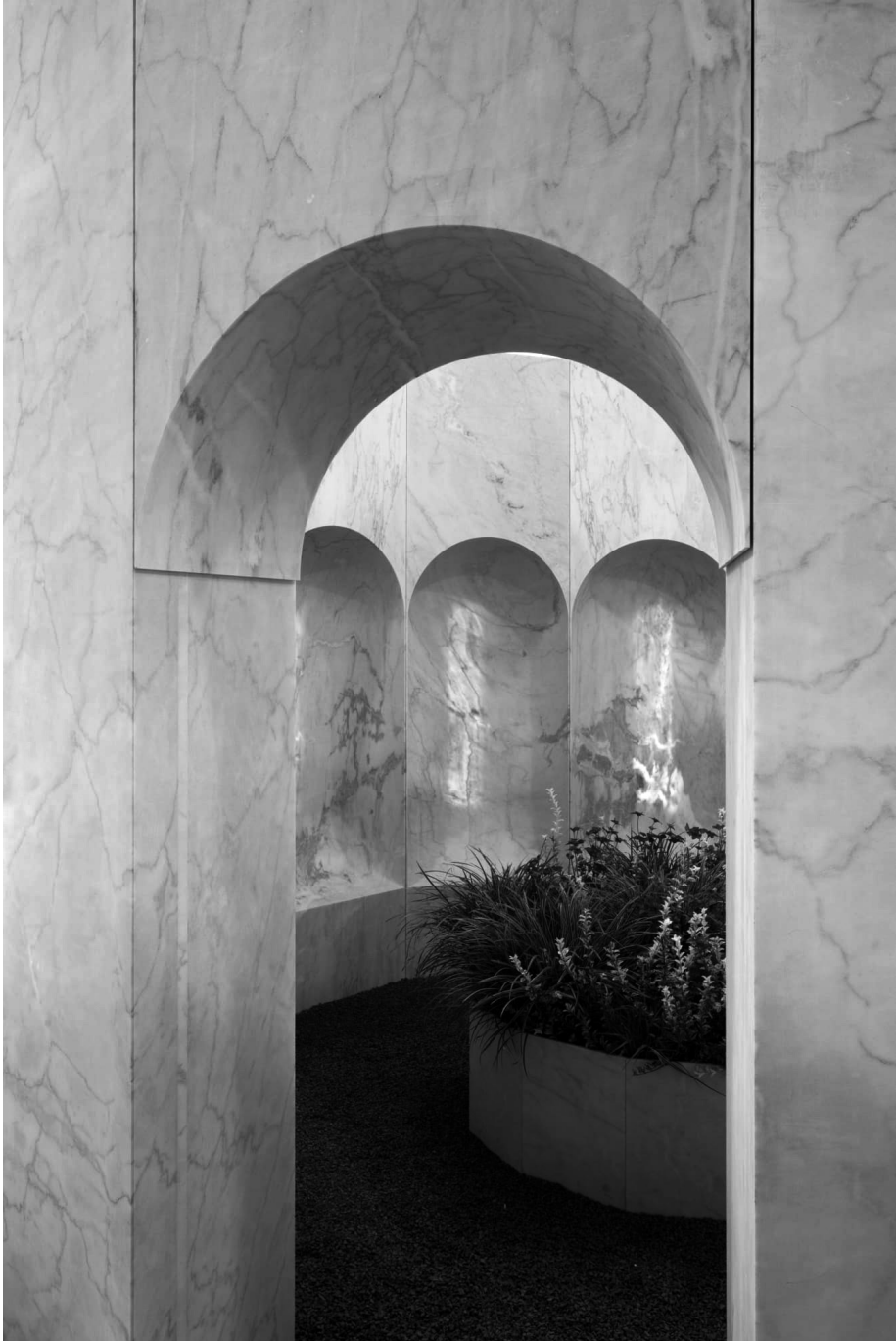
III. 4. Go Hasegawa, Bright Cloister, Guastalla 2017