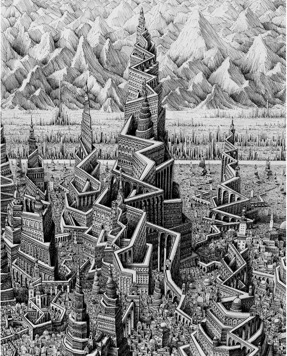
III. 5. Benjamin Sack, Garden in Thought source: https://www.bensackart.com/

The visions of the cities created by Dwurnik and Stack are an intuitive record indicating their isolation and alienation. They constitute boundless concepts of forms known from history juxtaposed in an immeasurable scale. They remain in images as a metaphor of cities built