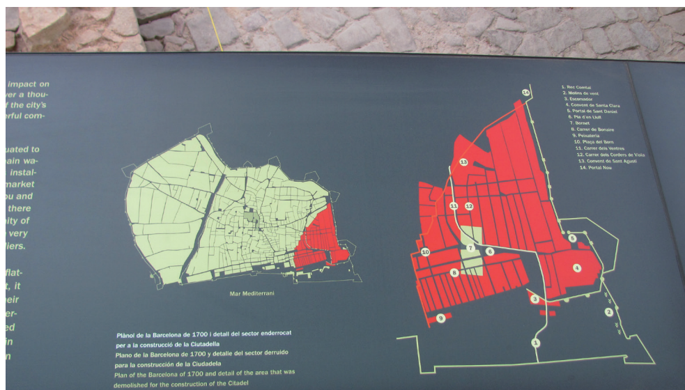
Ill. 12. Plan of the destroyed part of La Ribera district on the background of old Barcelona (left). The position of Mercat del Born shows how little of the former urban tissue is presented in the exhibition (right)

designed to be across several floors – platforms suspended on a structure which did not interfere with the newly discovered ruins and the delicate cast iron structure of the hall of Mercat del Born. Nevertheless, eventually this version, very costly and controversial 43 , did not become realised.