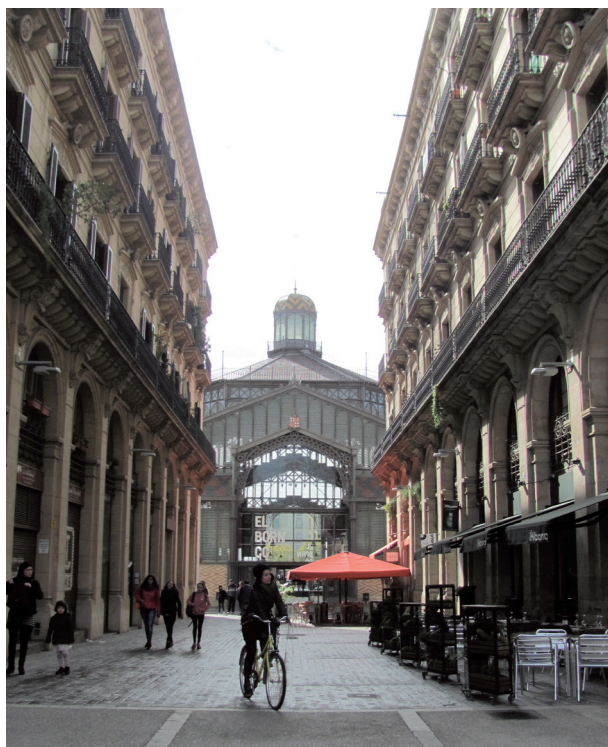
III. 17. El Born Cultural Center seen from the site of Parc de La Ciutadella

This structure received an award of the city of Barcelona for the year 2013; it also housed historic celebrations commemorating the 300 th anniversary of the defeat from the year 1714. Over thirty years of work on the revitalisation of the edifice of the nineteenth-century market hall Mercat del Born, were combined with large-scale archaeological and architectural studies; all the design-related decisions were largely dictated by these studies. At the end of the day, the building, put into use in 2014, serves as a reminder of the traumatic history of the city, and at the same time, it introduces new life to the historic architectural structure, which was abandoned for decades and is of unique historic value.