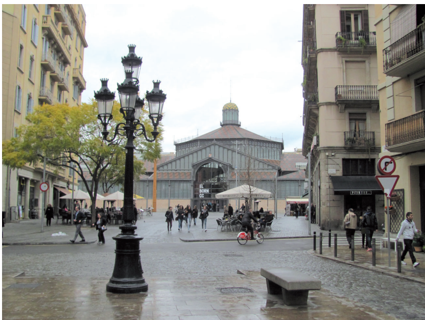
Ill. 11. Barcelona, Mercat del Born converted into the Cultural Centre as seen from the Passeig del Born