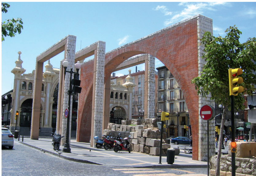
Ill. 1, 2. Contemporary exposition of the remains of Roman defense system, Saragossa