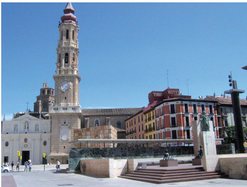
III. 5. Plaza de la Seo with Forum Museum as seen from Plaza del Pilar