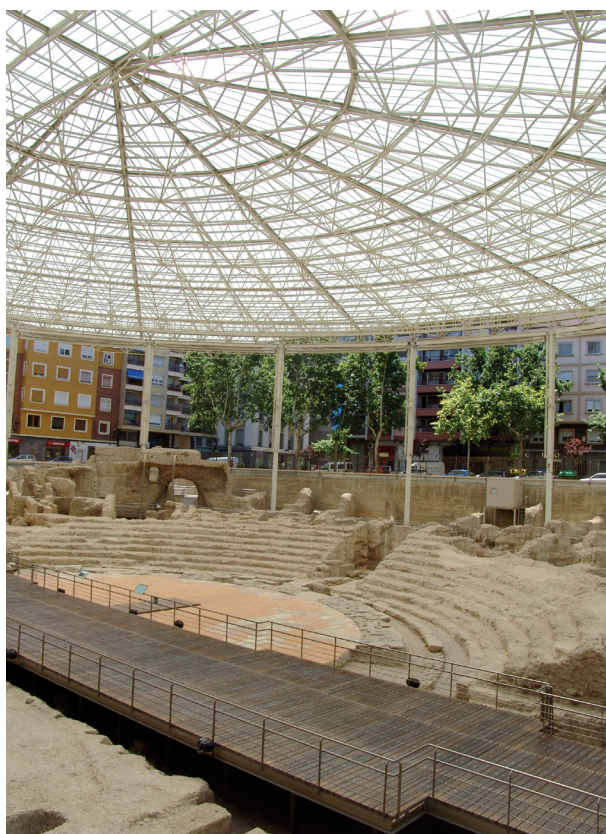
Ill. 3. Theatre Museum, Saragossa

The element of the plan from 1942 that was the most visible in the dense historic tissue was the monumental square, Plaza del Pilar, in the foreground of Europe's oldest shrine to Our Lady, Basilica Santa Maria del Pilar 16 . Actually, it is an extension of a piazza bearing the