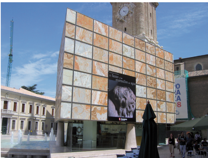
III. 6. Forum Museum at Plaza de La Seo