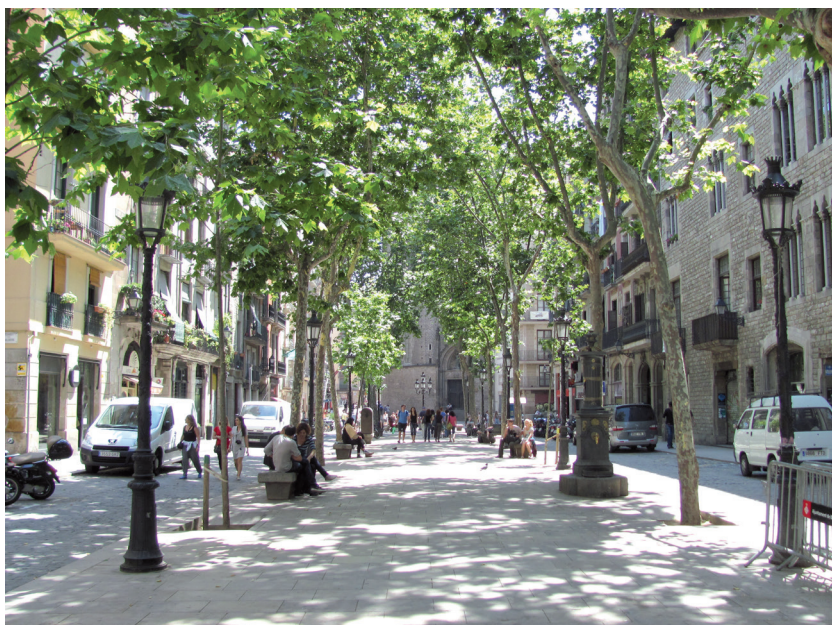
Ill. 10. Barcelona, Passeig del Born – view towards Santa Maria del Mar cathedral