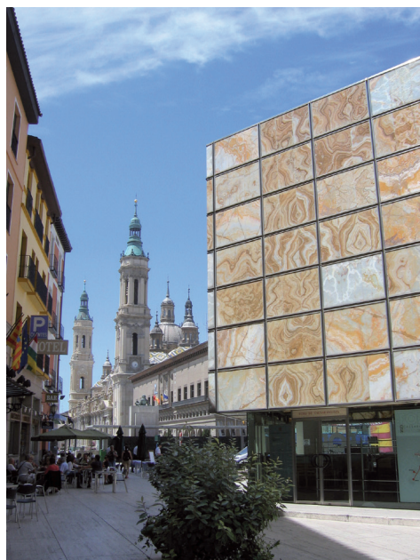
III. 7–8. Stone wall of the museum frames the views towards the cathedral (7) and Basilica del Pilar (8)