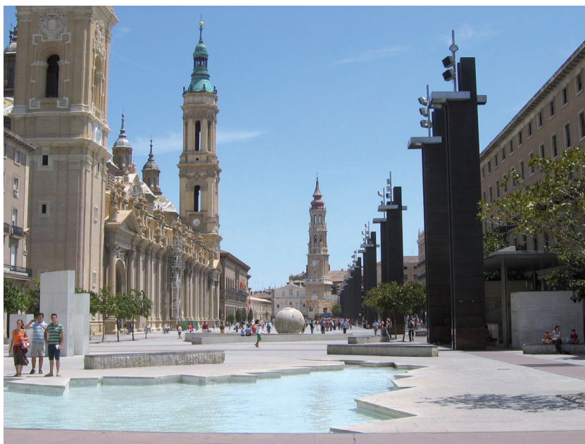
Ill. 4. Plaza del Pilar, Saragossa, view towards Plaza de la Seo

same name, situated there since the 17 th century, orientated parallel to the longer, southern side of the basilica. By the demolition of the city quarters this space was linked to Plaza de Cezar Augustó from the west near the church of San Juan de los Panetes, and from the east with Plaza de la Seo, closed with a beautiful cathedral 17 . The sequence of urban interiors open to each other spanning nearly 0.5 km from the side of the river is encased predominantly by monumental historic structures, including churches, the city hall, and the archbishop's palace and the southern frontage is composed mostly of buildings from the 1940s, emphasised with a pompous geometric colonnade. Today, it is the largest hardened representational public square of Zaragoza, rich in statues and fountains 18 , hiding relics of the previous epochs underneath its surface.