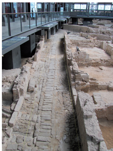
III. 13–16. Archeological site within the Mercat del Born as the prolongation of the public space of the city of Barcelona

and archaeological relics. Multifunctional halls and a coffee shop with a reading room, as well as administration facilities, are housed in glass boxes in four corners of the market hall. This corresponds to the spatial structure of the initial market hall. The total integration of the internal covered space accessible to the public with the public spaces of the city corresponds to the latest tendencies in this respect 46 .