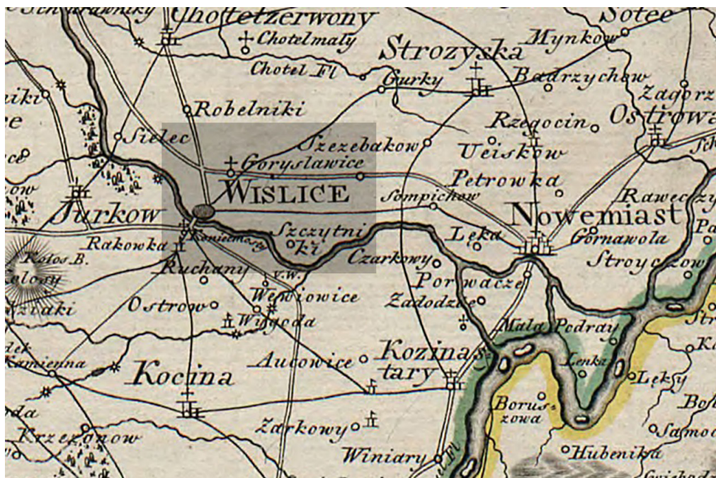
Fig. 1. Wiślica on Reymann's map from 1797, copy in the Archive KHAUiSzP WA PK, s.v.

The urban complex in Wiślica comprises several elements, which, either in their entirety or as relics, have survived until the present. Among them, there are: the medieval urban layout; a complex of the Collegiate church of the Nativity of the Blessed Virgin Mary, which includes: a church, a bell tower and the house of Długosz – the rectory; relics of the Romanesque church of St. Nicholas; relics of the church of St. Martin; an archaeological-architectonic reserve “Regia”; relics of the 1 st and 2nd Romanesque church and the hill-fort [1].