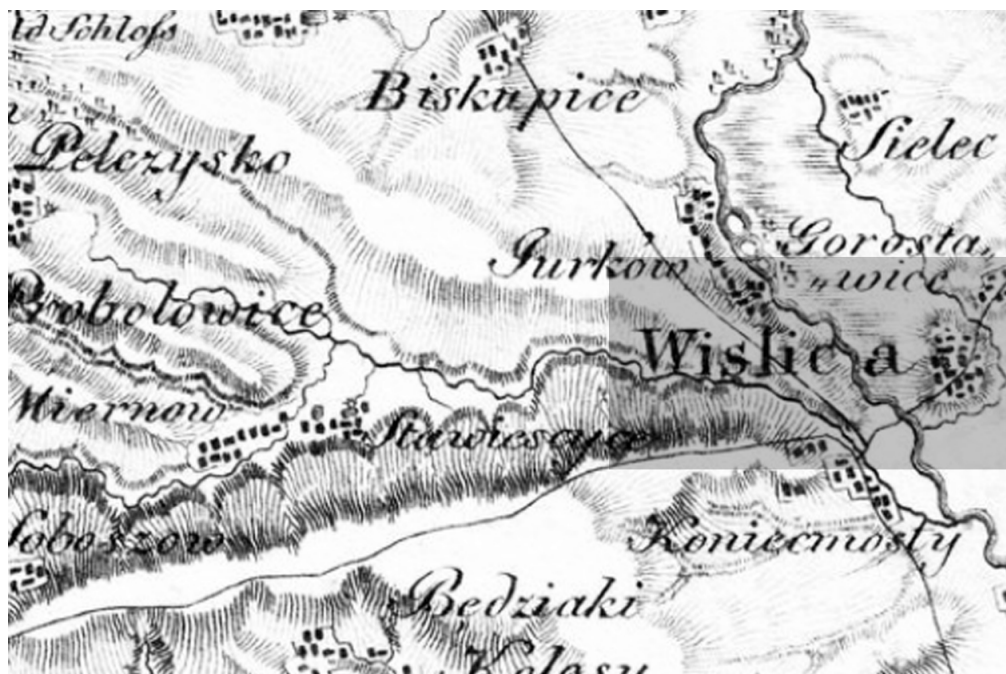
Fig. 2. Wisłica on the map by Anton Mayer von Heldensfeld from 1808