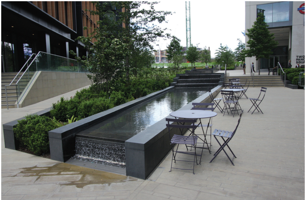
Fig. 6. Pancras Square