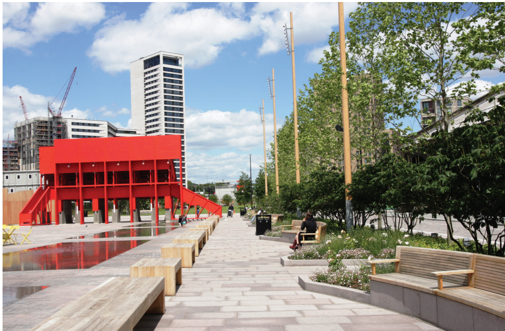
Fig. 4. Water in the space of Lewis Cubitt Square

A green extension of Lewis Cubitt Square to the north is Lewis Cubitt Part 9 open to users since 2015, the main green common of the revitalised area in King's Cross. The park has the shape of a rectangle of the area equal to 0.65 ha. On both sides of the park, the ground has been raised along longer ends. The gentle variation of the ground levels, defined by soft elevation lines, outlines subtly semi-private places in the space of the park encouraging individual relaxation and leisure.