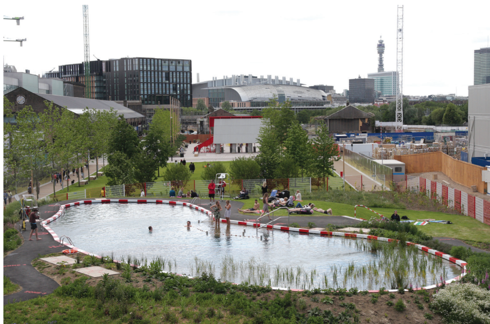
Fig. 5. Art installation Of Soil and Water: King's Cross Pond Club in the area of Lewis Cubitt Park

At present, the greatest attraction in this part of the King's Cross revitalised area is the pond 10 situated at the end of the green space of Lewis Cubitt Park and with a building site in the adjacent area. The water reservoir, open for use on the 15 th May 2015, is a temporary art installation 11 promoting water recycling realised within the framework of Relay Arts Programme. Water in the pond is cleansed in a closed cycle with the use of various species of water plants. Vegetation typical of wetland has been planted to the north of the pond, in its direct vicinity. Similarly to the floating islands placed on the waters of Regent's Canal, the Floating Forest Garden or the Viewpoint floating platform, the pond is to draw attention to the dependencies and mutual relations between humans and the natural environment as well as to the results human activity brings to the environment. It is yet another place to stop and look for the answer to the question what significance has sustainable development, where is the place for humans, water and greenery in the space of the city. Simply by staying in this space of water and greenery and by looking at it and at the neighbouring building site from the viewing platform located on the northern side of the pond, visitors have the possibility of watching the ongoing transformations and, in a certain way, participating in them (Fig. 5).