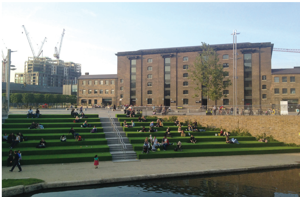
Fig. 2. View over the Canalside Steps located on the left bank of the canal; in the background the building of Central Saint Martins University of the Arts situated at Granary Square (photo by U. Nowacka-Rejzner, 2014)