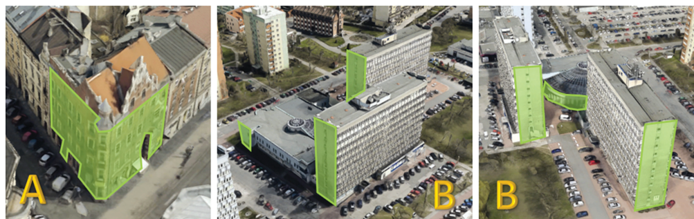
Fig. 2. Visualization of green walls on the facades of the analyzed buildings. The area of green walls excluding window and door openings is marked in green. A – tenement building “Pod Pajakiem”, B – Municipality of Krakow, own work based on photo from [21]

Explanation: A – “Pod Pajakiem” tenement house (base of the building – 450 m 2 , elevation for the creeping vine – 690 m 2 ), B – Municipality of Krakow (base of the object – 2,900 m 2 , elevation for the creeping vine – 1,300 m 2 ) E – elevation available for greening, P – base surface of the building, own work