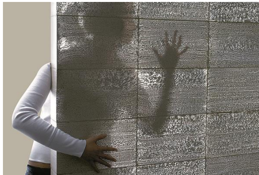
Fig. 1. Photo of LiTraCon's blocks [8].

LiTraCon includes approx 96% concrete mixture with fine grain size and 4% fiber optics. The grain size and diameter of the optical fibers have been selected to allow for correct light construction of the finished element structure. Optical fibers are arranged parallel to one another and perpendicular to the edge of a concrete block. This allows for partial light transmission. This means that applying LiTraCon you can see both the shapes and colors of objects on the other side of the material. An example of LiTraCon blocks is presented in Figure 1.