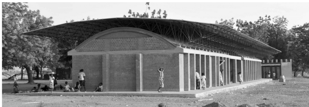
III. 1. School in Gando, Burkina Faso. Ventilated roof space