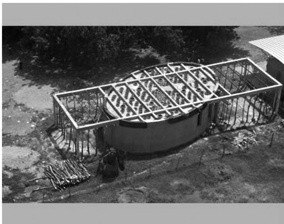
Ill. 14. Library in Gando. Burkina Faso. Top view of a ventilated roof (source: [2])

A public library was designed next to the school by the same architect. The building has an elliptical shape and is made of clay brick, an accessible, local material. Thick walls are virtually devoid of windows, thus creating a human friendly microclimate inside the building. Additional interior lighting is achieved by designing round holes in a flat roof, performing the function of ventilation ducts and natural ventilation. The shape and structure of the roof covering, make this a very interesting object due to the material used and the architect's unique idea. The use of traditional clay pots to create holes for light and ventilation is a unique phenomenon in the world. The clay pots were brought to the site by local people, then cut appropriately and placed on the formwork between the structural beams. Once prepared, the roof was covered with concrete, thus creating the possibility of vertical ventilation of the building and its indirect illumination. A rectangular lightweight steel ventilated roof sits above the whole structure and extends out beyond the library. The contour of the roof is connected to the vertical, openwork, eucalyptus elements. They provide additional shade and favourably influence the microclimate of the interior favorably (Ill. 14–17).