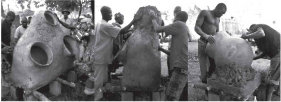
Ill. 18. Women's Association Centre in Gando. Burkina Faso. Casting of clay vessels used to store food products in the wall

to develop their economic and educational situation, health, nutrition and agriculture. The village community will contribute to the building through voluntary efforts, which will keep construction costs low. (Ill. 18–19).