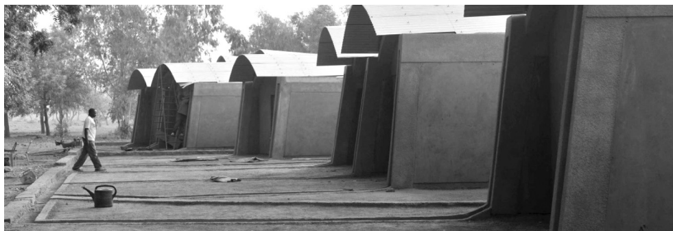
Ill. 12. Teachers housing in Gando Burkina Faso. Visible channels to drain and collect rainwater (source: [8])