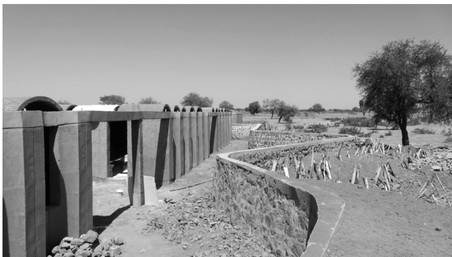
Ill. 10. Lower secondary school in Gando. School building during construction. Photo from the embankment (source: [6])