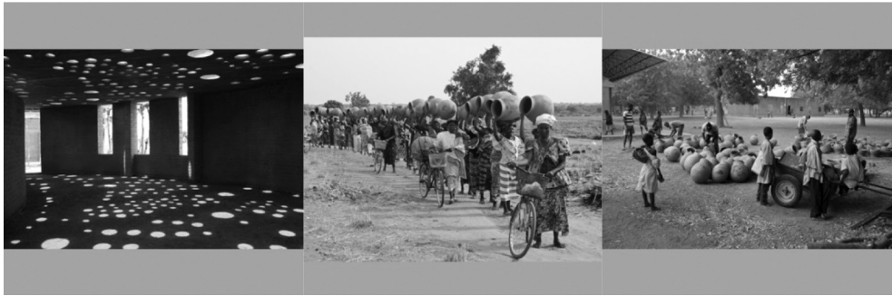
Ill. 15. Library in Gando. Burkina Faso. From left: Main room of the library with a perforated, ventilated roof, rural community carrying clay pots used to build the library