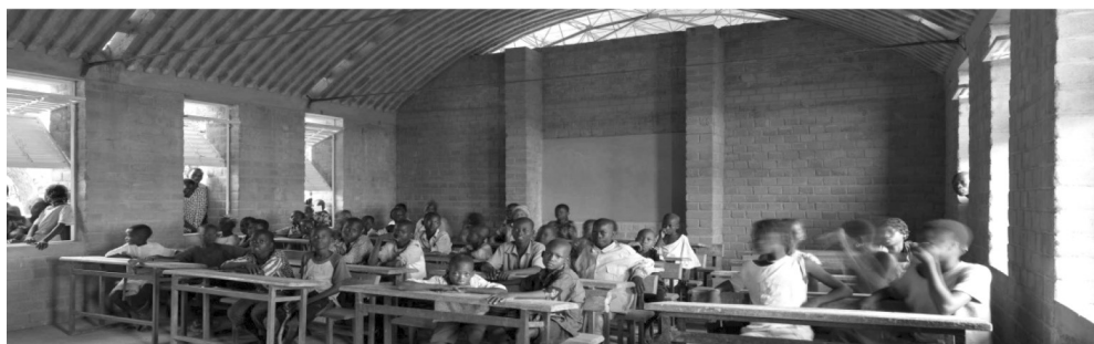
III. 3. School in Gando, Burkina Faso. Classroom with a prominent barrel vault, which contains ventilating holes (source: [1])