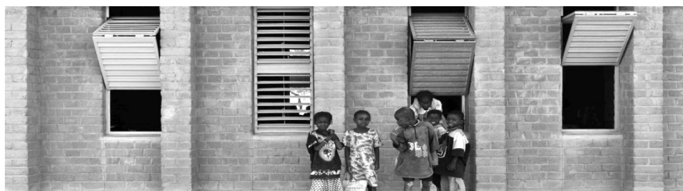
III. 2. School in Gando, Burkina Faso. Colourful, openwork shutters