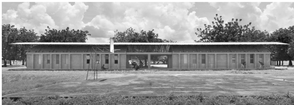
III. 4. School in Gando, Burkina Faso. The facade of the building