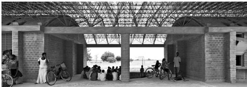
III. 5. School in Gando, Burkina Faso. The amphitheater recess, covered with steel roof truss – a playground and a meeting place for children