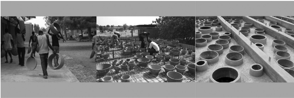
Ill. 16. Library in Gando. Burkina Faso. From left: Arranging trimmed ceramic vessels in the reinforcement of the floor slab and the finished floor