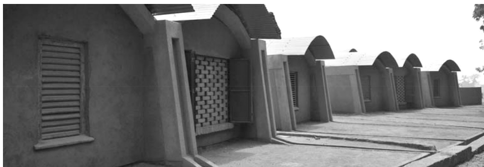
Ill. 11. Teachers housing in Gando, Burkina Faso. Openwork, ventilated front elevation