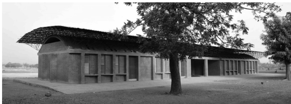
III. 7. School in Gando, Burkina Faso. A view of the object