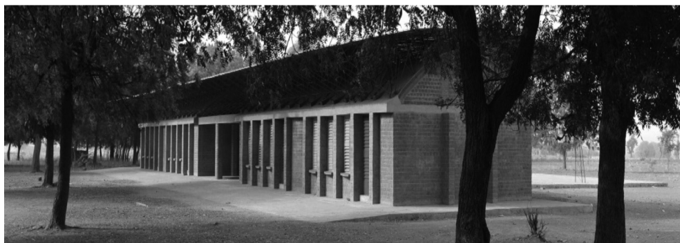
III. 6. School in Gando, Burkina Faso. A view of the object (source: [1])