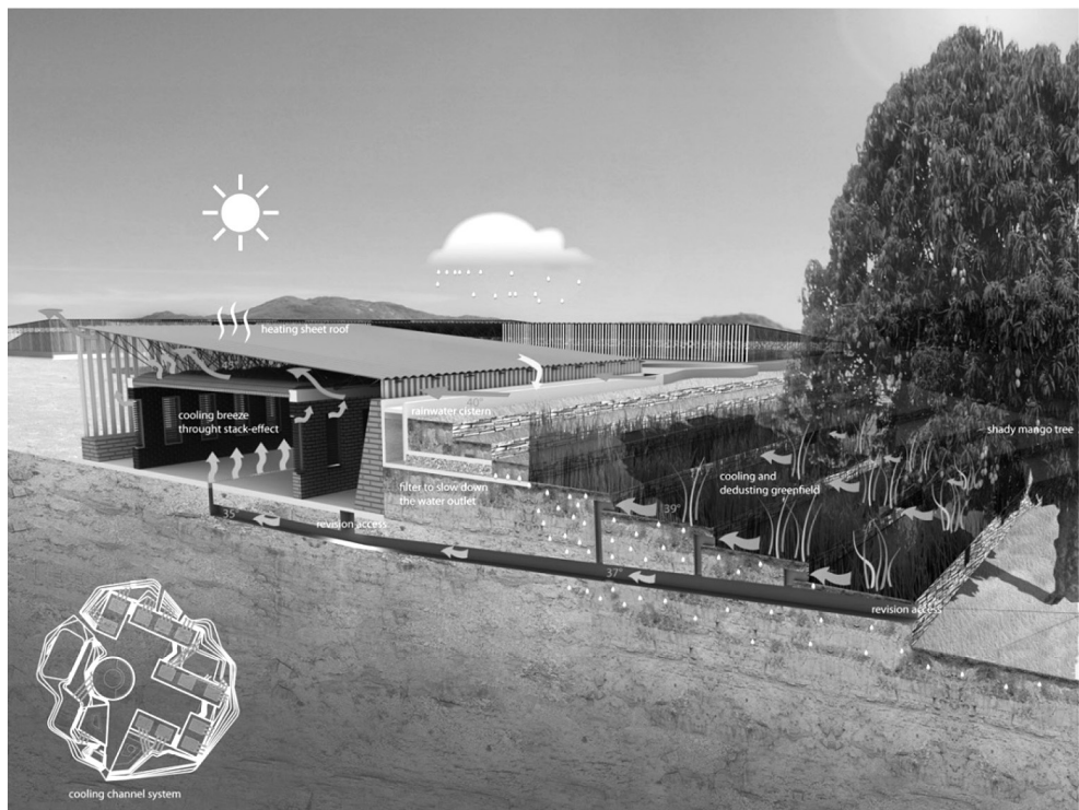
III. 8. Lower secondary school in Gando. Burkina Faso. Schematic natural ventilation school