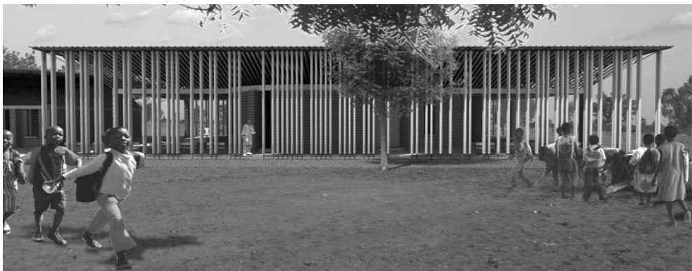
Ill. 17. Library in Gando. Burkina Faso. Computer visualization of the facility and its cross-section (source: [2])