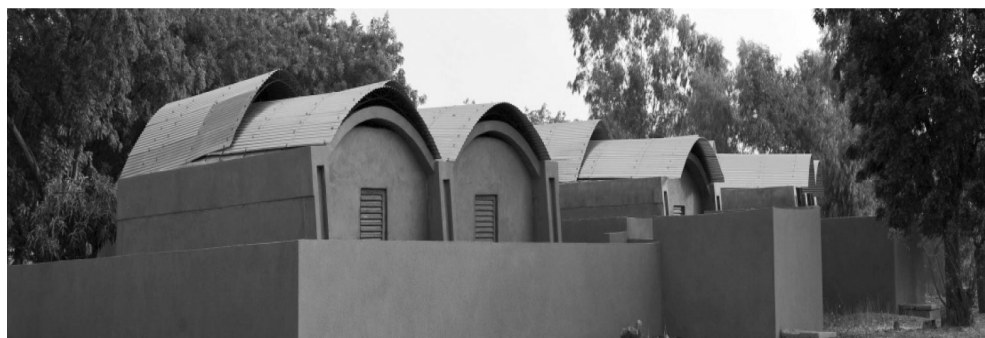
Ill. 13. Teachers housing in Gando, Burkina Faso. Double-layer barrel ventilated roofs