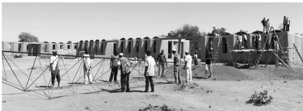
III. 9. Lower secondary school in Gando. Burkina Faso. School building during construction